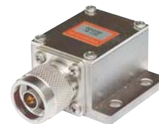
SMA OR N CONNECTORS 150, 250 & 500 WATTS

KEY: Inches [Millimeters] .XX ±.03 .XXX ±.010 LX ±0.8 .XX ±0.25J