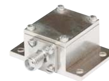
SMA 50 & 100 WATTS